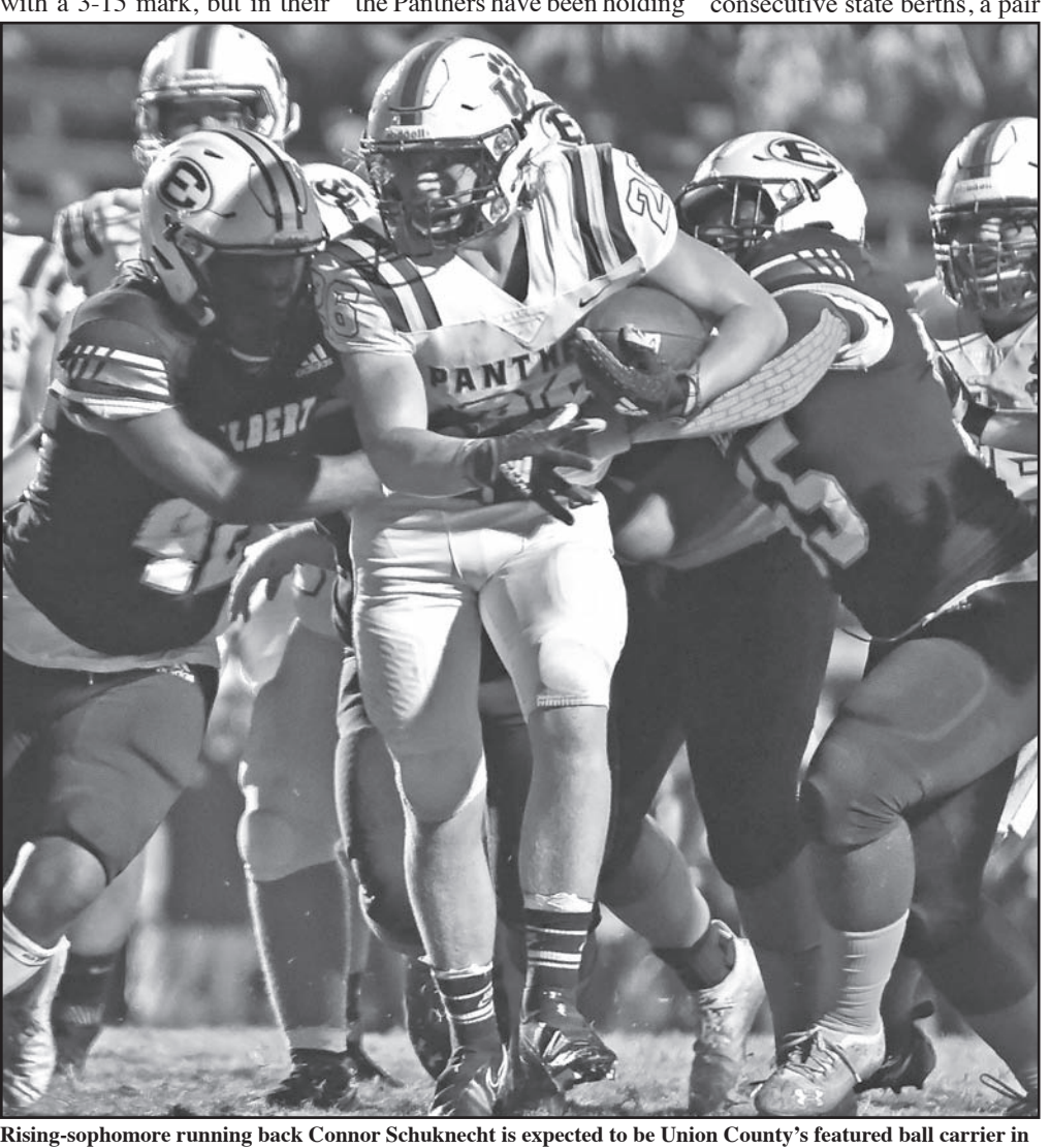
2022 following a freshman campaign that saw Schuknecht average 4.2 yards per carry.

Banks County's football, volleyball and boys basketball teams were all bounced in the